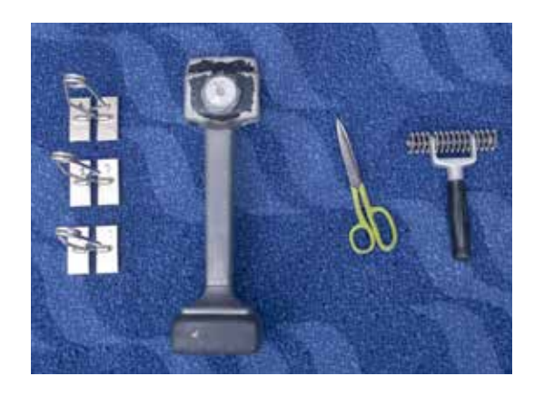
Tools from left to right: Seam squeezers Knee kickers Napping shears Carpet seam roller