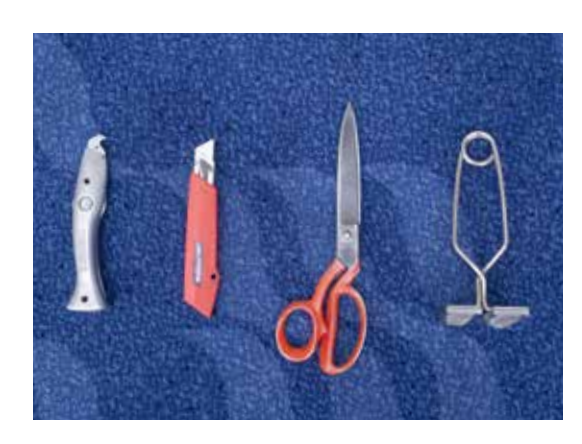
Tools from left to right: Carpet hook knife Utility knife Carpet shears Seam squeezer